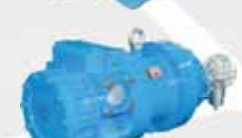
MHV MAG-M SERIES Flow up to 45 mc/h Head up to 8 bar