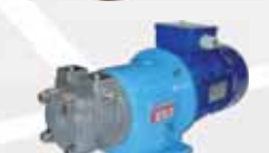
VANEMAG SERIES Flow up to 3 mc/h Head up to 14 bar