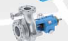
CN SEAL-M SERIES Acc. to API 610 11th ed. Flow up to 4000 mc/h Head up to 220 m