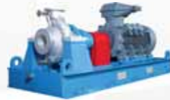
CR MAG-M API SERIES Acc. to API 685 2nd ed. Flow up to 4000 mc/h Head up to 220 m For solid handling capability