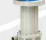
CV MAG-P SERIES Centrifugal Vertical Mag-Drive pumps Flow up to 140 mc/h Head up to 44 m Length up to 5 m

Standard pump models are available from stock or in a very short lead time