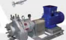
WA MAG-M SERIES Acc. to API 685 2nd ed. Flow up to 100 mc/h Head up to 80 m