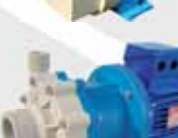
CM MAG-P SERIES Flow up to 35 mc/h Head up to 23 m