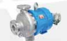
CN MAG-M SERIES Acc. to ANSI B 73.3 Flow up to 4000 mc/h Head up to 220 m