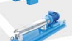
V MODULAR SERIES Flow up to 2 mc/h Head up to 48 bar