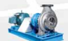
CN MAG-M SERIES Acc. to DIN EN 22858 BF VERSION Flow up to 4000 mc/h Head up to 220 m