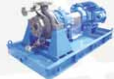
CN MAG-M API SERIES Acc. to API 685 2nd ed. Flow up to 4000 mc/h Head up to 220 m