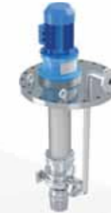
CNV MAG-M SERIES Centrifugal Vertical Mag-Drive pumps Flow up to 500 mc/h Head up to 120 m Length up to 7 m