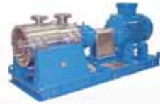
CN MAG-MS SERIES Acc. to API 685 2nd ed. Flow up to 300 mc/h Head up to 700 m