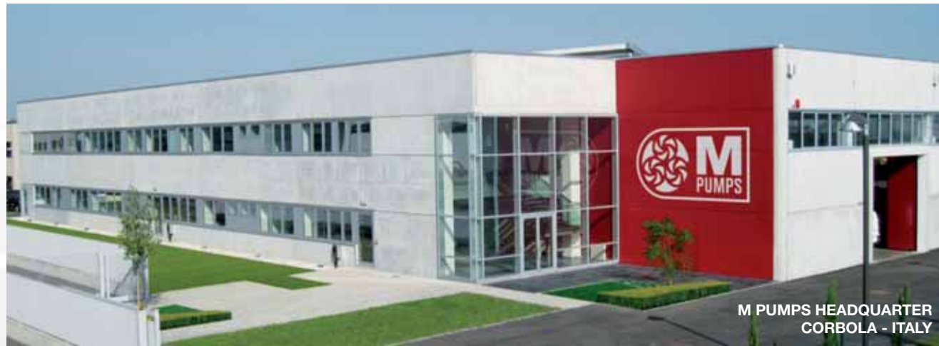
M PUMPS HEADQUARTER CORBOLA - ITALY

What you get from M PUMPS: 21st century design, materials and engineering technology.