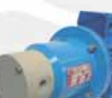
VP SERIES Flow up to 3 mc/h Head up to 5 bar