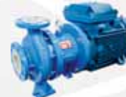
CL MAG-M SERIES Acc. to DIN 22858 CC and BF version Flow up to 480 mc/h Head up to 80 m