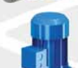
CMV MAG-P SERIES Centrifugal Vertical Mag-Drive pumps Flow up to 30 mc/h Head up to 44 m Length up to 0,5 m