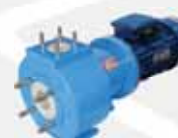
CMP ARMORED SERIES Acc. to DIN EN 22858 Flow up to 75 mc/h Head up to 60 m