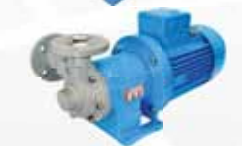
T MAG-M SERIES Flow up to 9 mc/h Head up to 90 m