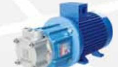
T ECO MAG-M SERIES Flow up to 1,5 mc/h Head up to 85 m