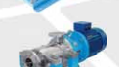
SC MAG-M SERIES Flow up to 35 mc/h Head up to 360 m NPSH up to 0,5 m