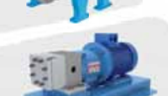
GS MAG-M SERIES Volumetric gear Mag-Drive pumps Flow up to 80 mc/h Head up to 30 bar