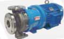
CN MAG-M SERIES Acc. to DIN EN 22858 CC Version Flow up to 250 mc/h Head up to 145 m