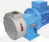
T MAG-MP SERIES Flow up to 13 mc/h Head up to 53 m