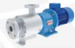
CV MAG-M SERIES Flow up to 3 mc/h Head up to 12 bar NPSH up to 0,5 m