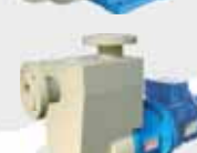
CSP MAG-P SERIES Flow up to 70 mc/h Head up to 32 m Self-Priming up to 4 m