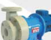
C MAG-P SERIES Acc. to DIN EN 22858 Flow up to 140 mc/h Head up to 44 m