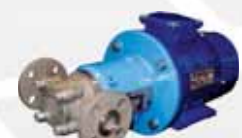
V IN LINE SERIES Flow up to 3 mc/h Head up to 14 bar