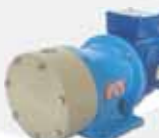
T MAG-P SERIES Flow up to 13 mc/h Head up to 53 m