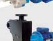
TSP MAG-P SERIES Flow up to 12 mc/h Head up to 50 m Self-Priming up to 5 m