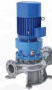
CN MAG-MV SERIES Centrifugal Vertical in line Mag-Drive pumps Flow up to 1800 mc/h Head up to 95 m