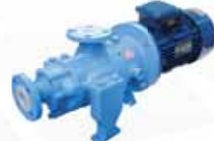
CT MAG-MS SERIES Flow up to 12 mc/h Head up to 1000 m NPSH up to 0,5 m