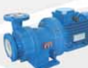
C MAG-PL SERIES Acc. to DIN EN 22858 Flow up to 140 mc/h Head up to 44 m