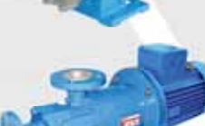
CT MAG-M SERIES Flow up to 12 mc/h Head up to 164 m NPSH up to 0,5 m