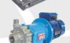
CM MAG-M SERIES Flow up to 35 mc/h Head up to 36 m